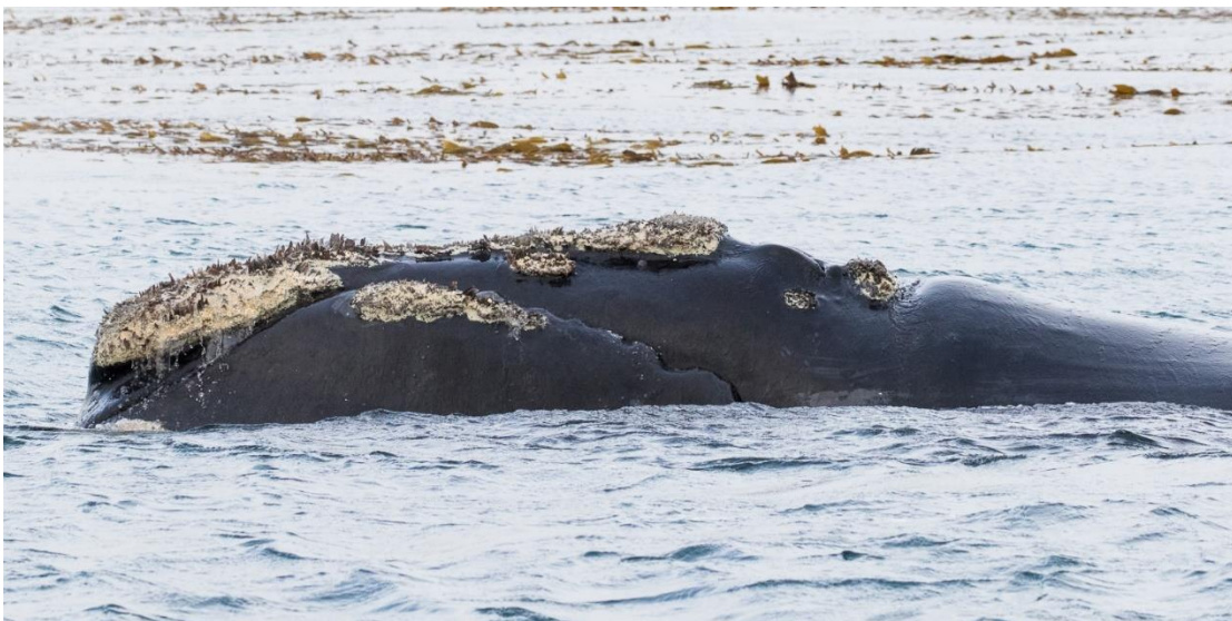
Figure 1. Project study species in the Falkland Islands: (a) sei whale and (b) southern right whale.

DPLUS126 aims to address some of these critical questions, including the first attempt to carry out satellite telemetry on whales in the Falklands, which will provide detailed fine-scale data on the movements and depth profiles of whales in, and potentially beyond, Falklands' waters. A winter aerial survey will be carried out to assess southern right whale abundance in regions adjacent to the north-east Falklands, and calibrated Unmanned Aerial Vehicles (UAVs) will measure the body size parameters of right whales via photogrammetry to assess their health. This suite of work will be carried out over two field seasons (2022 and 2023) using aerial and boat platforms. Boat surveys will focus on the coastal waters of the north-east Falklands, particularly Berkeley Sound during summer and the coastline north to MacBride Head during winter (Figure 2).